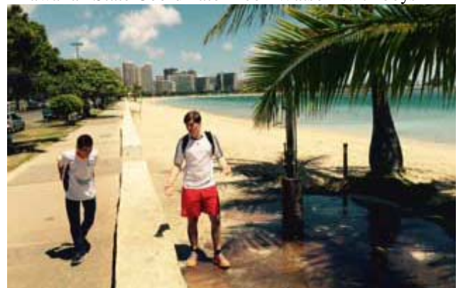
2 guys follow walk from Honolulu along beach