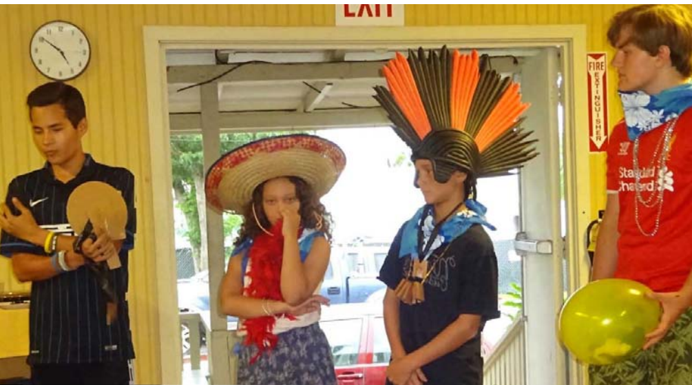
Exchange Students & host siblings contemplate what to do without electronics